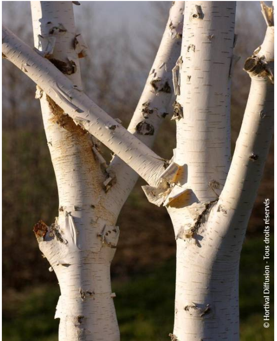
Himalayan birch. A pure white stemmed selection.