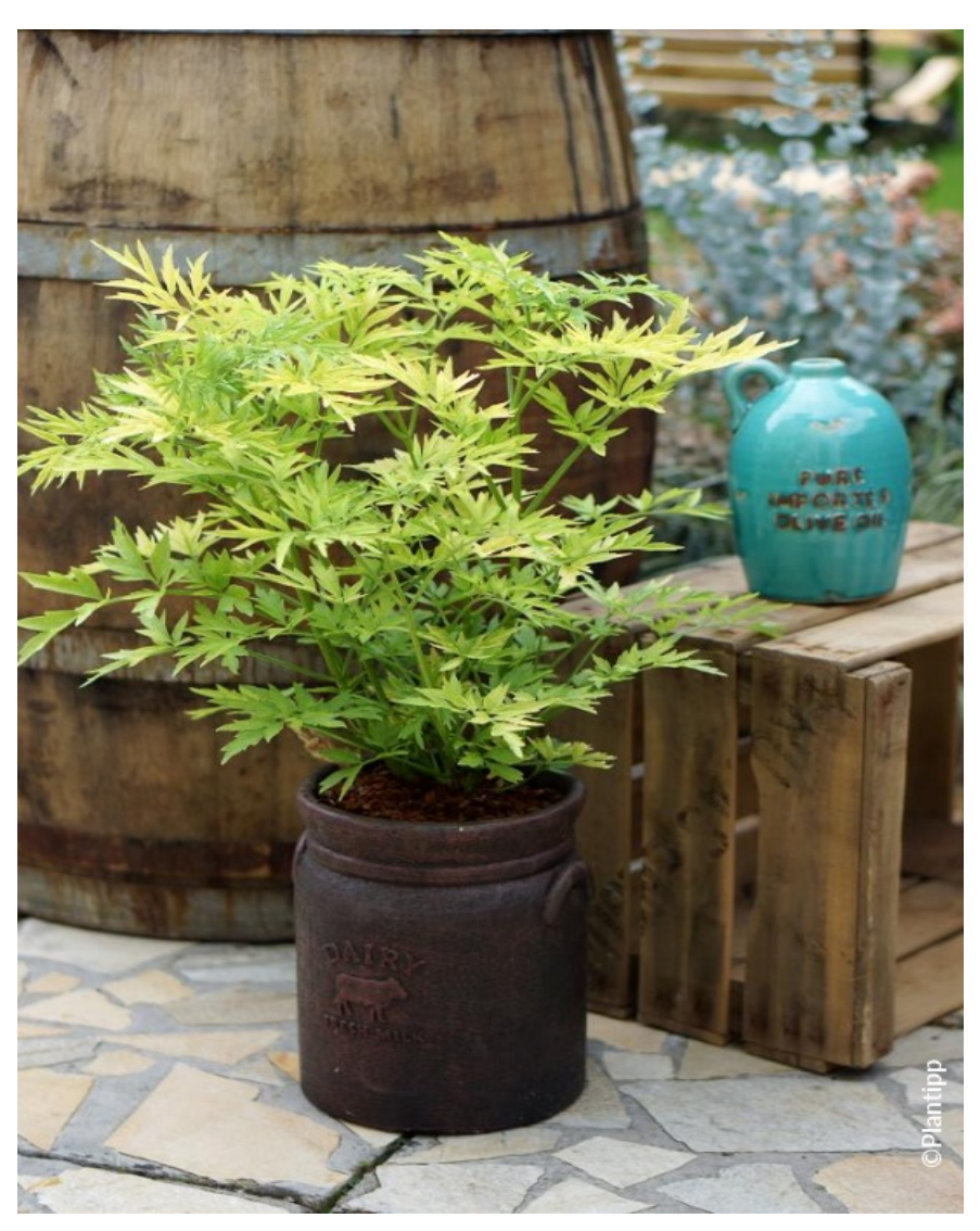
'Elder'. Hardy deciduous upright shrub with deeply cut yellow leaves.

Maintenance advice: At the end of winter, prune if necessary. Cut short the older branches to rejuvenante and a maximum of a third in length from the younger branches to maintain good flowering.