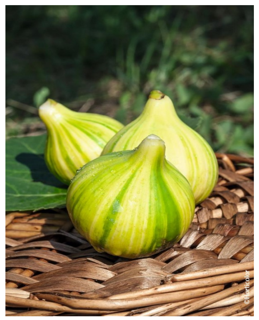
Fig. Original white striped fruit with red flesh.

Maintenance advice: At the end of winter, lighten the plant by removing branches near the center. Cut down any eventual new shoots growing at the base.