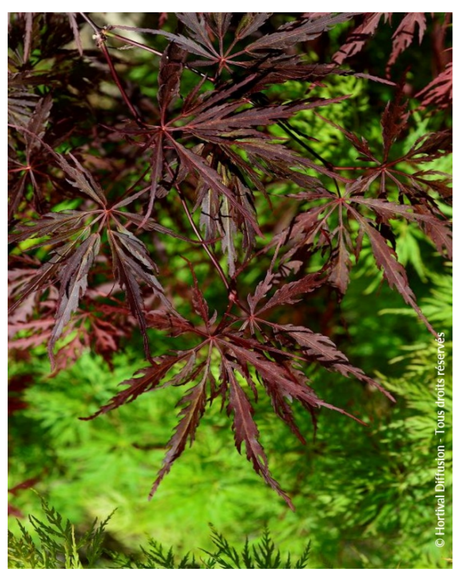
A slow growing Japanese maple with deeply cut dark red leaves.

Maintenance advice: At the end of winter, remove any dead wood. Pruning is not necessary but can be done, moderately, between the end of summer and early autumn.