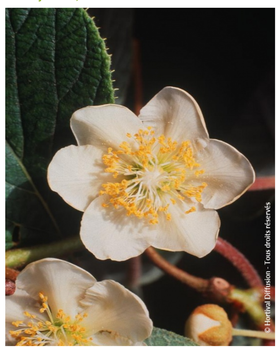
Self fertilising cultivar reliably fruiting.

Maintenance advice: At the end of winter, cut down any secondary branches having flowered to harmonize the structure. In summer, reduce growth by pinching new shoots, 2 leaves above flower bunches.