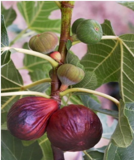
Fig 'Violette Daphine', Fig Dauphine Violet, Fig Grise de Tarascon