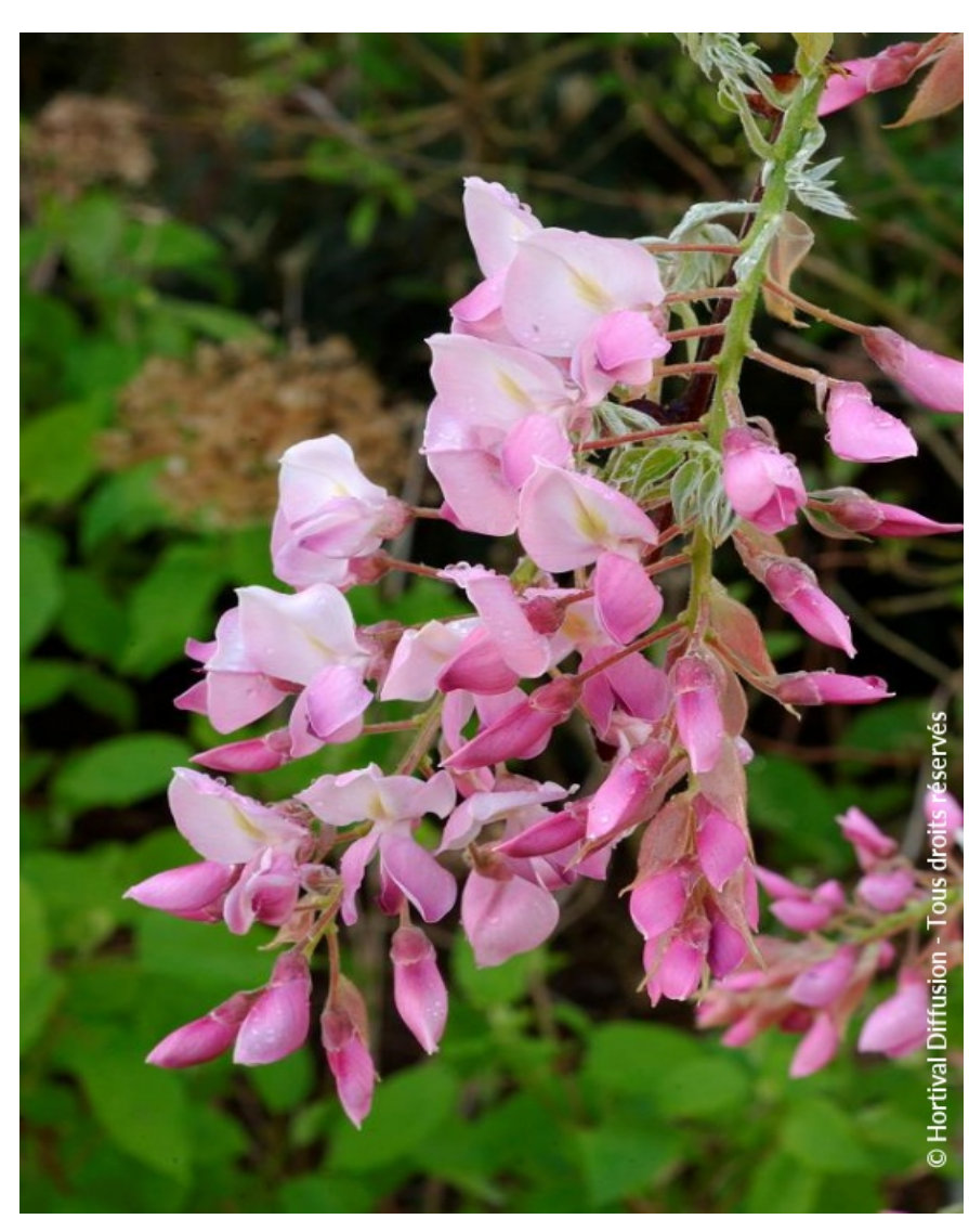
Hardy deciduous climber. Big pink flowers on short fat racemes.

Maintenance advice: At the end of winter, Cut short, keeping 4-5 flower buds per branch (bigger and rounder than the leaf buds). In autumn, shorten, about 20cm, length of shoots