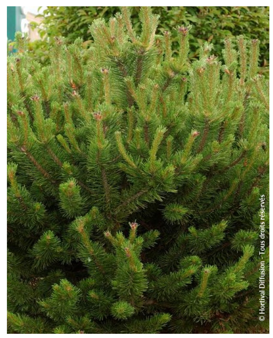
Mountain Pine : hardy slow growing conifer, lime tolerant.