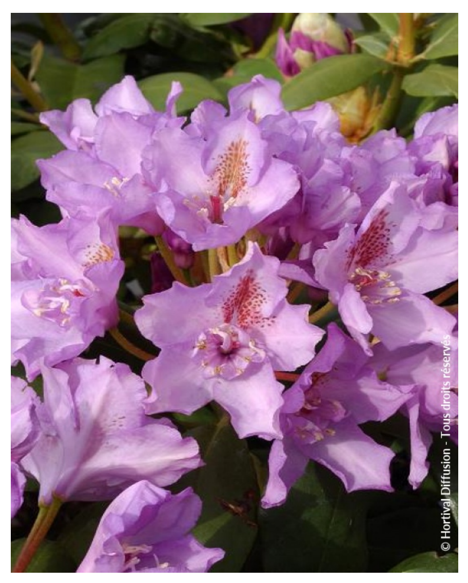
Evergreen ericaceous shrub, flowers mauve.

Maintenance advice: Water regularly in dry weather. From mid-August less watering encourages a better flowering in the following spring.