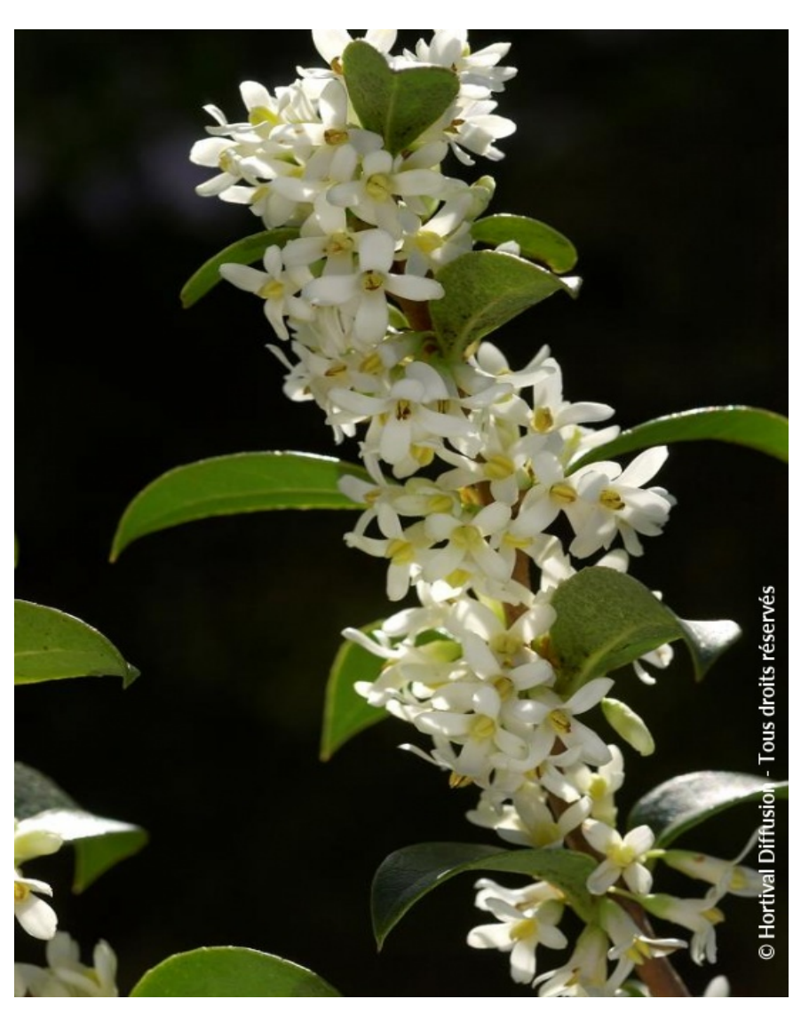
Evergreen shrub, small dark green leaves, copious small white scented flowers early spring.

Maintenance advice: If necessary, after blooming, in May-June, trim your Osmanthus to the desired dimensions.