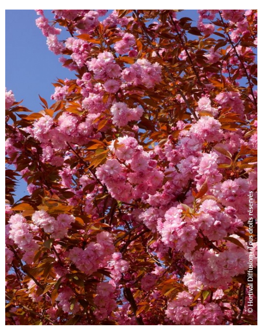
Deciduous tree with green leaves, double pompom pink flowers. Excellent autumn colour.

Maintenance advice: After the flowering, remove dead wood and a few low and spreading branches if necessary. Water regularly and abundantly for the first two years.