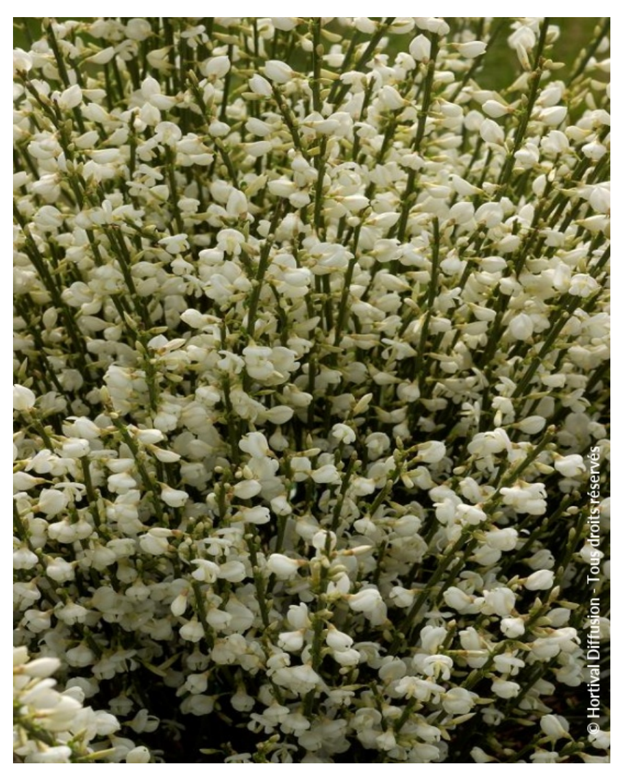
'Broom'. White early flowering shrub.

Maintenance advice: After the flowering, remove about 2/3 of the lenght of the branches to create harmonious shapes and to keep it compact. Remove its fruits in pods which are causing tiredness.